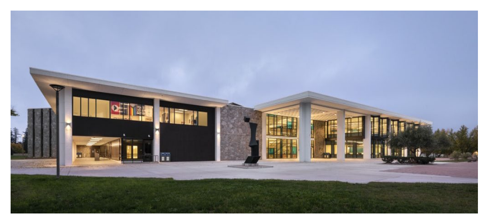
Figure 7 Stanislaus State new library

Stanislaus State Library: In 2022, Stanislaus State renovated and reopened the J. Burton Vasché Library; the original building of 127,000 SF was built in 1965. The $58 million project included full seismic upgrades, new fire protection systems, new building interiors, exterior