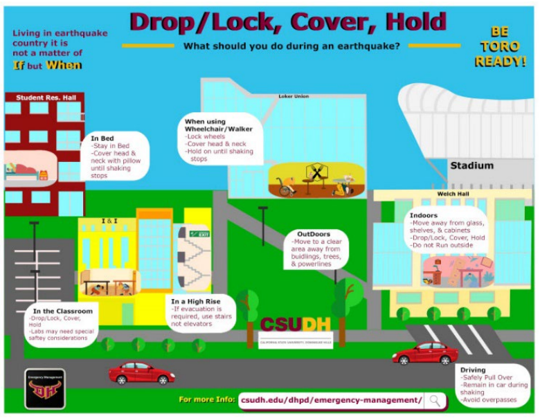
Figure 2 Example of educational outreach material from CSU Dominguez Hills

The CSU and its campuses actively participate in the annual October Great Shakeout Earthquake Drill. 83% of the CSU's 23 campuses have registered as participants for more than 10 years, with 8 of them having been participants since the inaugural Shakeout in 2008. Even despite the challenges posed during the height of the COVID-19 pandemic in 2020, 13 campuses held some form of drill for the event, whether in-person, virtual, or a combination of both. Since 2019, an average of 355,000 CSU individuals have participated in the Great Shakeout.