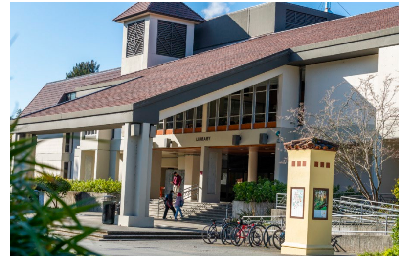
Figure 5 Cal Poly Humboldt Library Renovation

Cal Poly Humboldt Library Renovation: The $34 million seismic retrofit project of the 170,000 SF building began in 2018 and was completed in 2022. The renovations have improved the safety and integrity of the library based on the engineering models of a very large earthquake which are common in the local region.