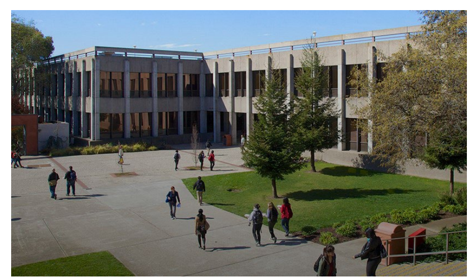
Figure 8 East Bay Library Annex

California State University East Bay in 2019 seismically strengthened the 42,000 SF Library Annex (East) Building with braced frames along the perimeter of the east wing of the library. The installation also required column strengthening and foundation work. The budget of $ 3,800,000 also included ADA improvements to correct accessibility deficiencies.