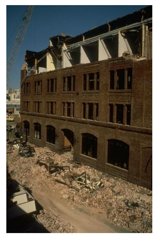
Collapse of inadequately retrofitted brick building onto cars in San Francisco after the 1989 Loma Prieta earthquake.

Other types of buildings pose risks that are significant, but generally lower or harder to identify: