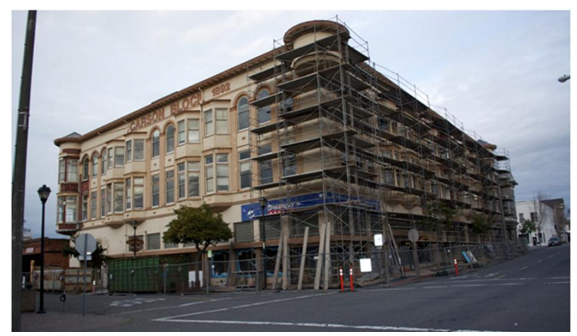
This retrofit project in Eureka took over 25 years to complete. It relied on federal tax credits for historical buildings and a loan from the city's Community Development Block Grant.

Most buildings are privately owned, but their risk of collapse affects occupants as well as the public. Both building owners and government agencies therefore have a stake in managing earthquake risks. It is in everyone's best interests for governments and building owners to collaborate in identifying vulnerable buildings and improving their earthquake resistance. After several decades of witnessing such collaborations, the Seismic Safety Commission has observed that fostering active dialogues, mutual understanding, and commitment are key to helping these efforts succeed. A few of the many success stories from California jurisdictions are presented here in sidebars.