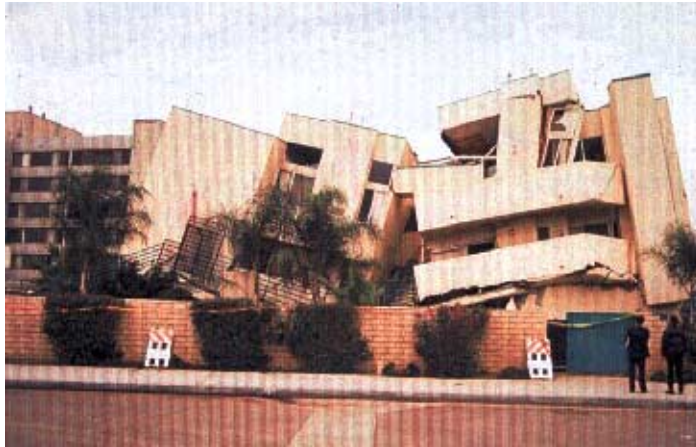
Apartment buildings with soft stories that partially collapsed after the 1994 Northridge earthquake.

At 4:31 on the morning of January 17, 1994, a magnitude 6.7 earthquake with an epicenter near Northridge rocked the San Fernando Valley and neighboring regions. The earthquake hit very early on a national holiday when most residents were home asleep. Fifty-seven people lost their lives, nearly 9,000 were injured, and damage exceeded $20 billion. The Northridge earthquake