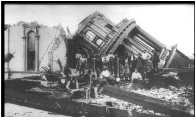
Santa Rosa City Hall in the aftermath of the great earthquake of 1906.