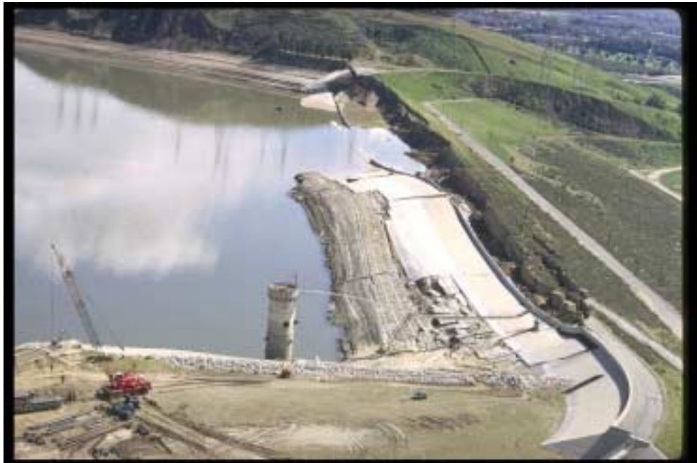
The upstream face and crest of the Lower San Fernando Dam slid into the Lower Van Norman Reservoir in 1971, prompting the evacuation of 75,000-80,000 residents downstream.

In 1982 and 1983, the commission held hearings on dam safety. Projects that were sponsored by local governments or agencies but designed and built by federal authorities were considered federal projects and did not undergo state or independent review. As with the Auburn and Warm Springs dams, the commission sought to bring independent review to all such critical projects. Finally, in 1993, the Army Corp of Engineers agreed to permit personnel from the state's Safety of Dams Division to review the safety of federal dam projects.