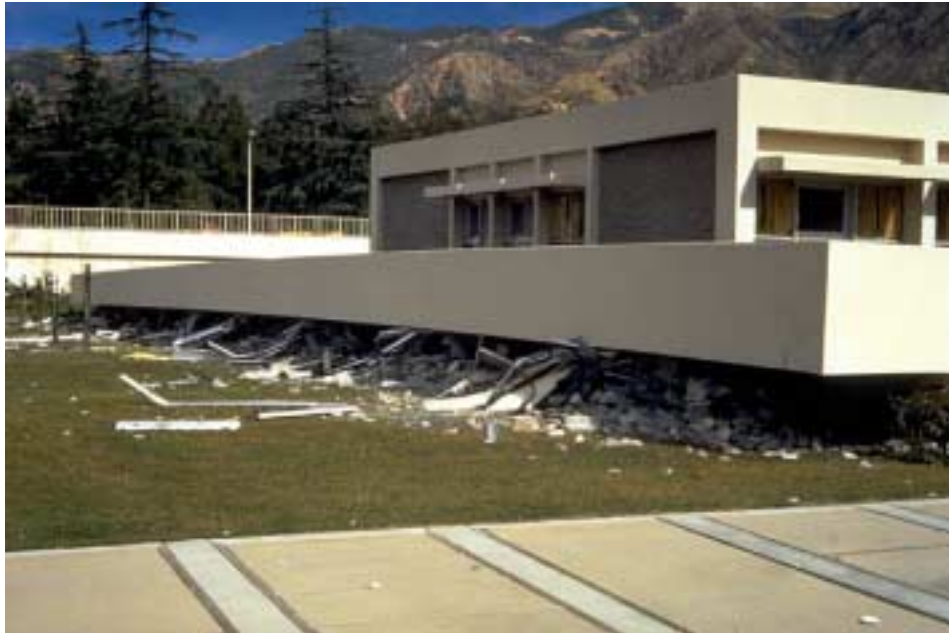
Collapse of the Psychiatric Ward of the Olive View Hospital in 1971.

In January 1972, Governor Ronald Reagan established the Governor's Earthquake Council as the administration's reaction to the San Fernando Valley earthquake and to the work of the Legislature's Joint Committee on Seismic Safety. The council continued in existence until the Seismic Safety Commission was up and running in 1975.