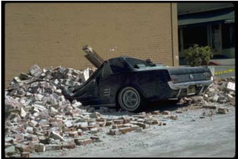
Car crushed by falling brick in the 1987 Whittier earthquake.

In May 1983, the Coalinga earthquake struck in southern Fresno County and caused at least $31 million in damage. Nearly 200 people were injured and approximately 1,000 left homeless. Production in the surrounding oil fields was disrupted and downtown businesses were forced to relocate or close as a result of earthquake damage. Coalinga was faced with rebuilding or repairing virtually the entire 12-square block downtown business district and replacing or repairing two-thirds of its housing.