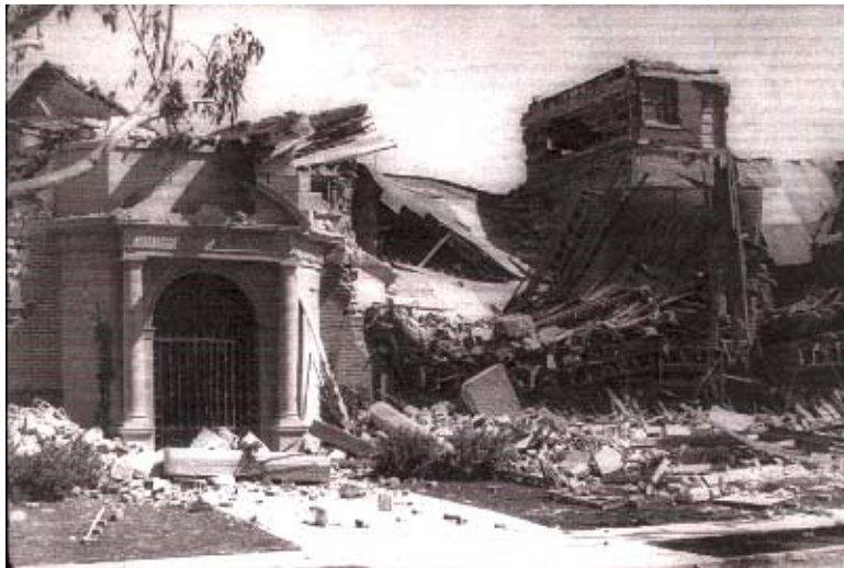
Jefferson High School after the 1933 Long Beach Earthquake.

Thus that 1933 Long Beach earthquake remains pivotal and historic. On March 10, 1933, a moderately strong earthquake struck just off the southern coast of Los Angeles County. It had the same intensity as a 1925 Santa Barbara earthquake, but occurred in a more densely populated region and produced considerably more damage. The quake caused 115 deaths and property estimated at $60 million, over $1.5 billion in today's dollars, primarily in Long Beach and adjoining suburbs of south Los Angeles. Fortunately schools were not in session when the temblor hit, but school buildings suffered a disproportionate amount of damage. All schools in Los Angeles were closed for one week to allow for structural inspections. Seventy schools were destroyed and 120 suffered major damage. In addition, 41 schools were deemed unsafe for occupancy and remained closed.