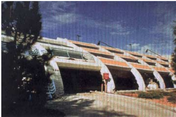
The California State University Northridge parking structure was built in the early 1990s and collapsed in the Northridge earthquake.