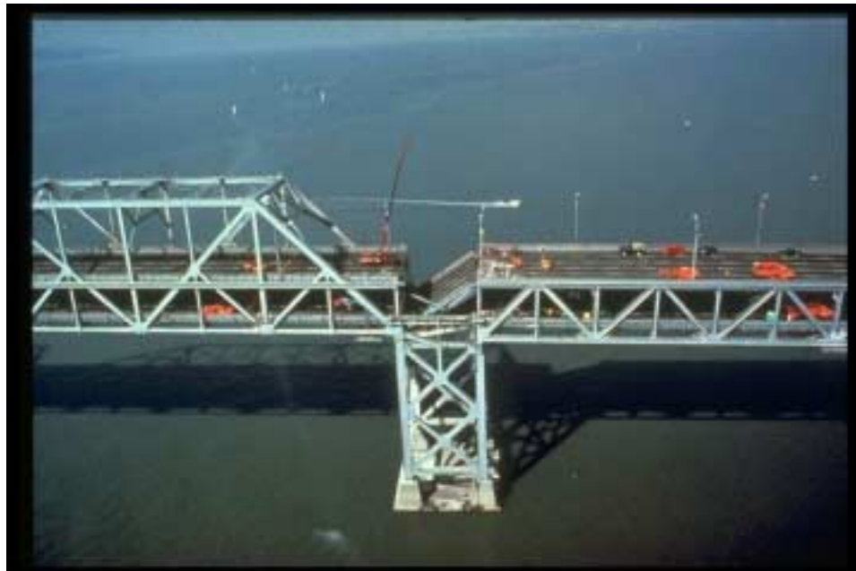
Collapse of the upper deck of the San Francisco Bay Bridge during the Loma Prieta earthquake in October 1989.