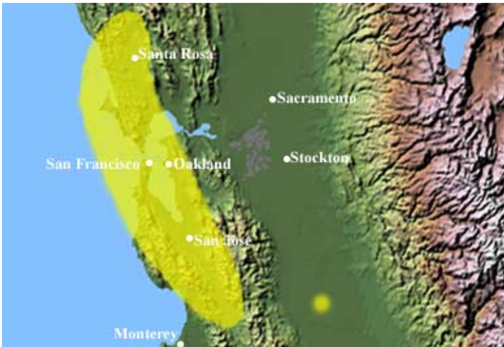
Figure 15. Yellow highlights from Figure 14 are overlaid to provide a rough indication of the areal extent of the effects of a hypothetical strike-slip fault with a similar magnitude 7.4, and with similar attenuation, site effects, and infrastructure vulnerability if it were to occur in Northern California.