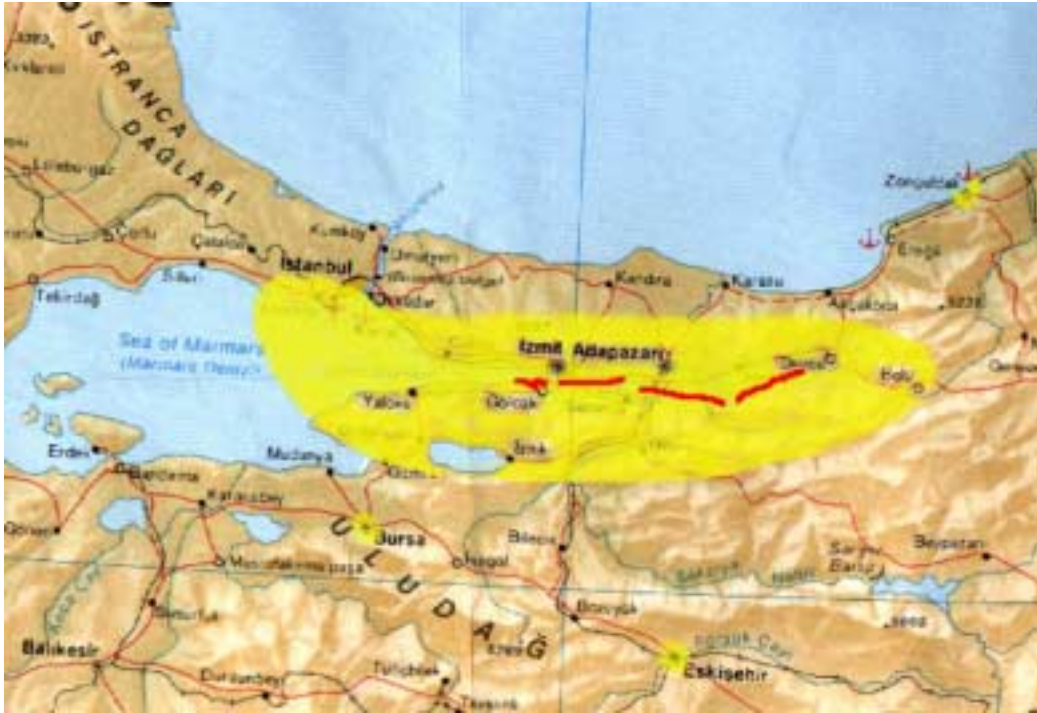
Figure 14. The yellow highlights indicate the approximate extent of strong ground shaking* and life loss in the August 17 th , 1999 Izmit, Kocaeli, Turkey Magnitude 7.4 Earthquake. (*MMI VIII & greater from USGS 1193)