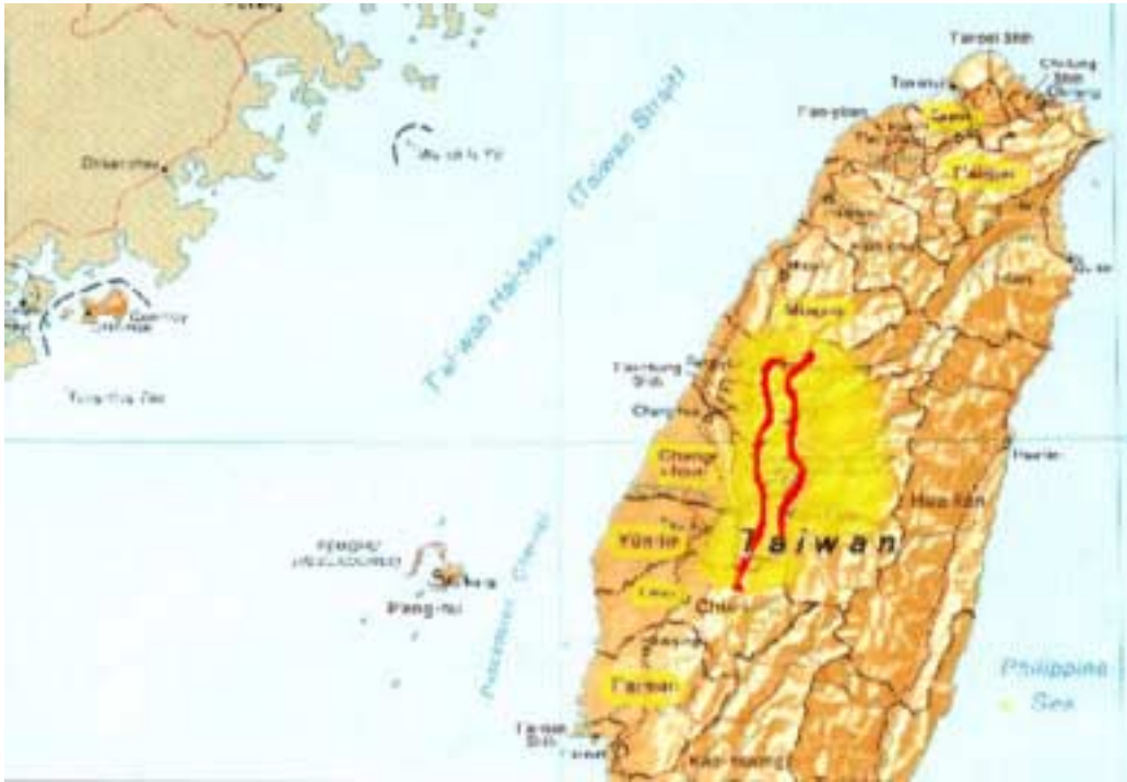
Figure 16. The yellow highlights indicate the approximate extent of strong ground shaking* and life loss in the September 21, 1999 Taiwan magnitude 7.6 Earthquake. (*PGA 40%g and greater from NCREE)