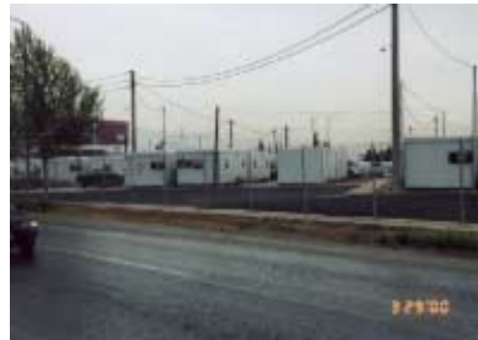
Figure 5. Those remaining homeless from the 100,000 displaced in Greece are now living in prefabricated units such as these.

Traffic gridlock in Athens also served as a reminder of what California can expect. Traffic jams severely hampered emergency medical, search and rescue efforts.