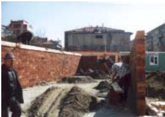
Figure 4. New unreinforced masonry under construction on the site of a collapsed concrete building in Düzce, Turkey.