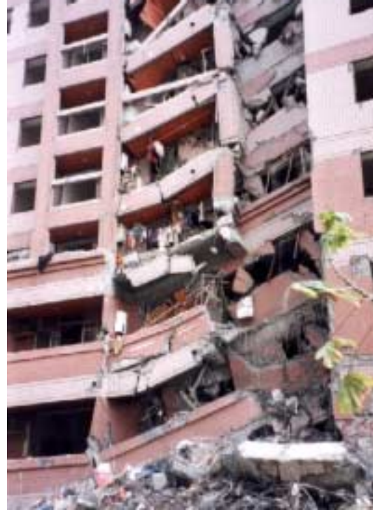
Figure 6. Concrete building in Taichung that partially collapsed.

Taiwan has used construction standards similar to California's Uniform Building Code for over 25 years. Those buildings built to comply with codes did well. However, new structures that did not do well appear to have been influenced by poor