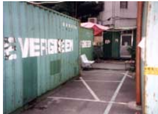
Figure 8. Temporary housing and hospital facilities in Taiwan were created in cargo containers after the closure of hospitals due to earthquake damage.

Major earthquake recovery legislation passed in early Jan 2000 required: