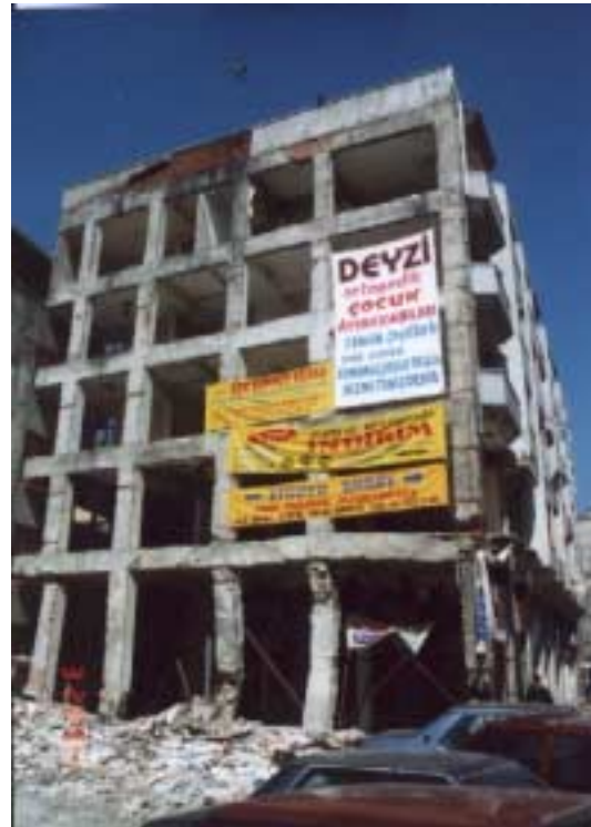
Figure 2. Severely damaged concrete building in Düzce, Turkey.

Approximately 100 people died due to land subsidence and flooding of low-lying buildings. An 8 foot tsunami caused localized damage around the Marmara Sea.