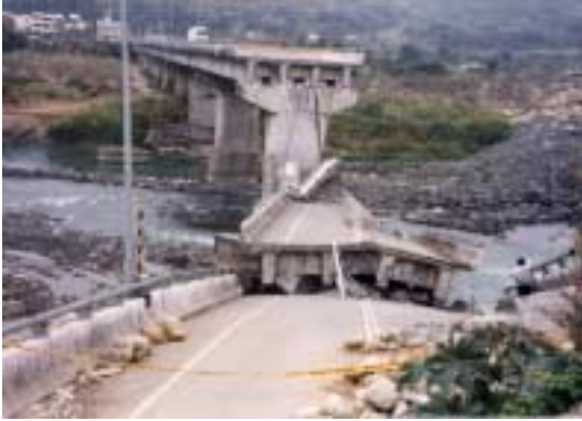
Figure 7. Bridge collapsed due to fault rupture.

This serves to emphasize the importance of enforcing geologic and geotechnical considerations before constructing critical and other facilities.