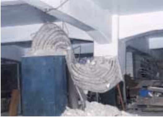
Figure 9. This concrete column buckled due to inadequate reinforcing steel.

Taiwan benefits from one of the best seismic monitoring networks in the world. Information recorded by this network during the earthquake and aftershocks will provide valuable ground motion data for use in California. The State and Federal Government are continuing to enhance similar networks in California.