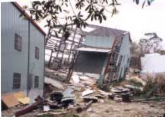
Figure 10. Many structures were destroyed or damaged not only from the strong shaking, but also due to significant fault rupture.