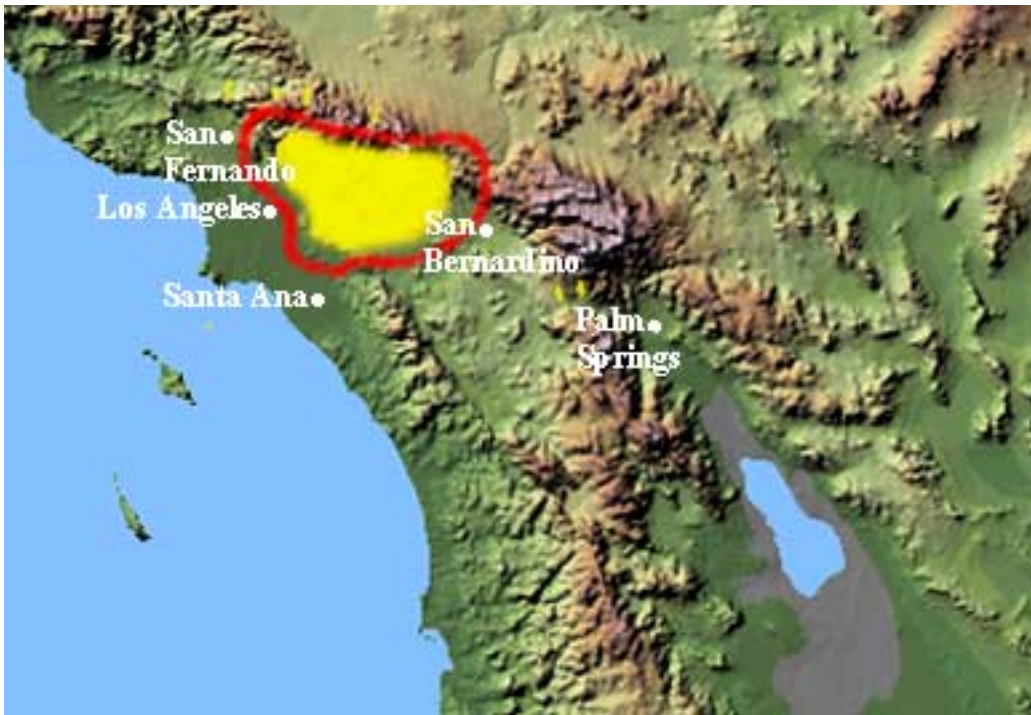
Figure 17. Yellow highlights from Figure 16 are overlaid for a rough indication of the areal extent of a hypothetical thrust fault scaled for a maximum Magnitude 7.0 earthquake expected on the Sierra Madre Fault assuming similar attenuation, site effects, and infrastructure vulnerability if it were to occur in Southern California. The red outline is similar in size to the region of strong shaking in the Magnitude 7.6 Taiwan Earthquake.