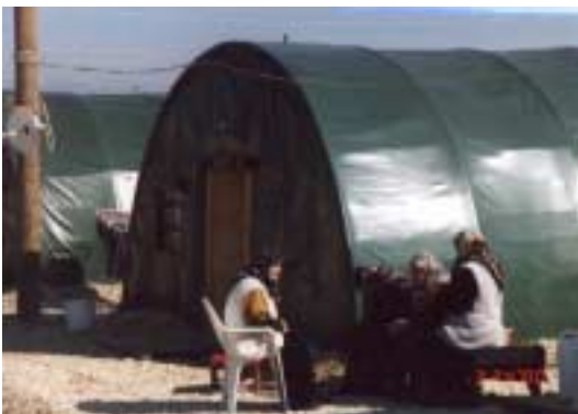
Figure 13. Life in tent cities has settled into a routine. Most of the 211,000 still-displaced victims in Turkey are expected to continue to live in temporary and interim housing well into next year.