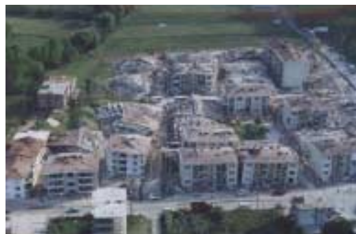
Figure 1. Concrete building collapses in Gölcük after the August 17 th Kocaeli Earthquake in Turkey.

On September 7, Greece experienced a magnitude 5.9 earthquake in the northwest portion of greater Athens. Compared to the earthquake in Turkey, damage was much less extensive.