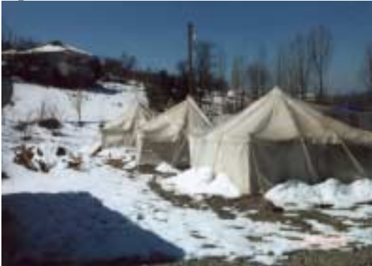
Figure 3. Turkey made worldwide requests for “winterized” tents.